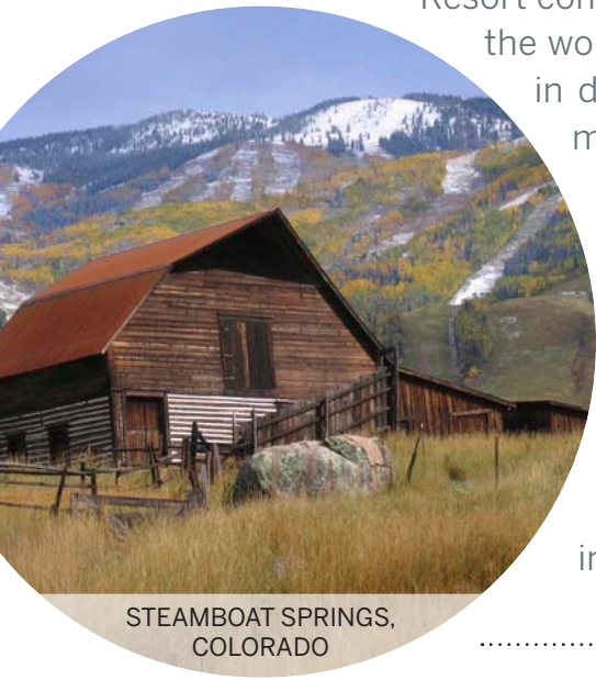
STEAMBOAT SPRINGS, COLORADO

Resort communities throughout Colorado, the western United States and around the world are prone to unique, heavily saturated luxury markets. Often found in desirable, slightly less accessible locations than national mainstream markets, resort markets tend to have a greater density of luxury offerings as higher net worth individuals are often drawn to them based on their exclusivity and proximity to world class activities year round. Seasonality, location, and employment opportunities drive the inventory of affordable homes down and most pricing within resort communities up. The famous Colorado Rocky Mountains, combined with the vast offerings of the western United States, continue to position the United States as one of the leading resort community destinations worldwide, and with the increasing desire for lifestyle-inspired home purchases, the resort community market will continue to rise.