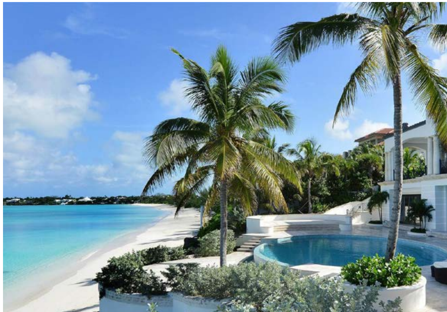
Lyford Cay Sotheby's International Realty | Nassau, Bahamas | $21,000,000 USD | PropID: CVF7S3

A beachfront estate located in the exclusive gated community of Old Fort Bay, this home features ocean views from nearly every room. The architectural details include a dramatic double staircase in the entrance foyer, pocket glass sliding doors, coffered ceilings and stone columns. The bespoke Downsview kitchen has top-of-the-line appliances, marble counter tops and opens to a family room with terrace access and ocean views. Wake up to the sounds and colors of the ocean in the spacious master bedroom; the master bath has marble counter tops, soaking tub and spacious walk-in shower.