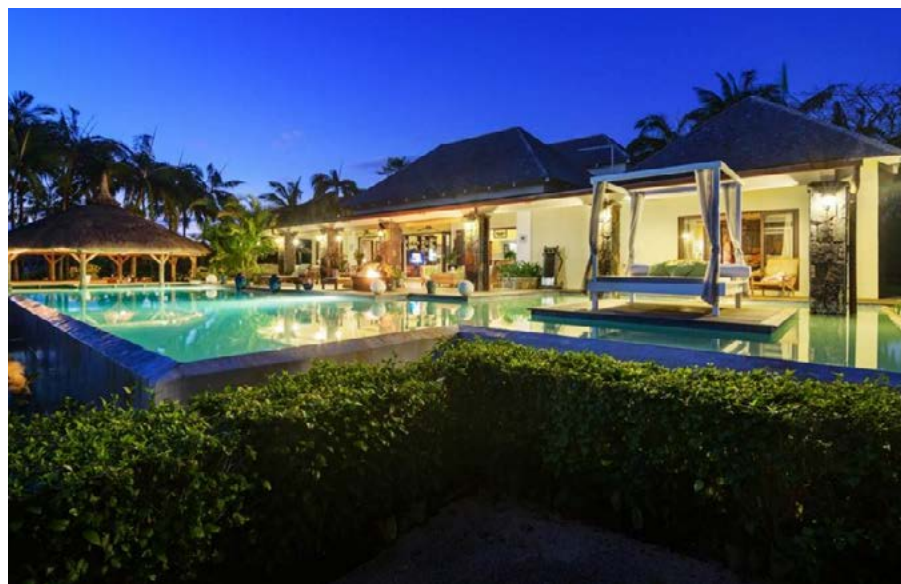
Mauritius Sotheby's International Realty | Chamarel, Mauritius | Price Upon Request | PropID: PXV9R9