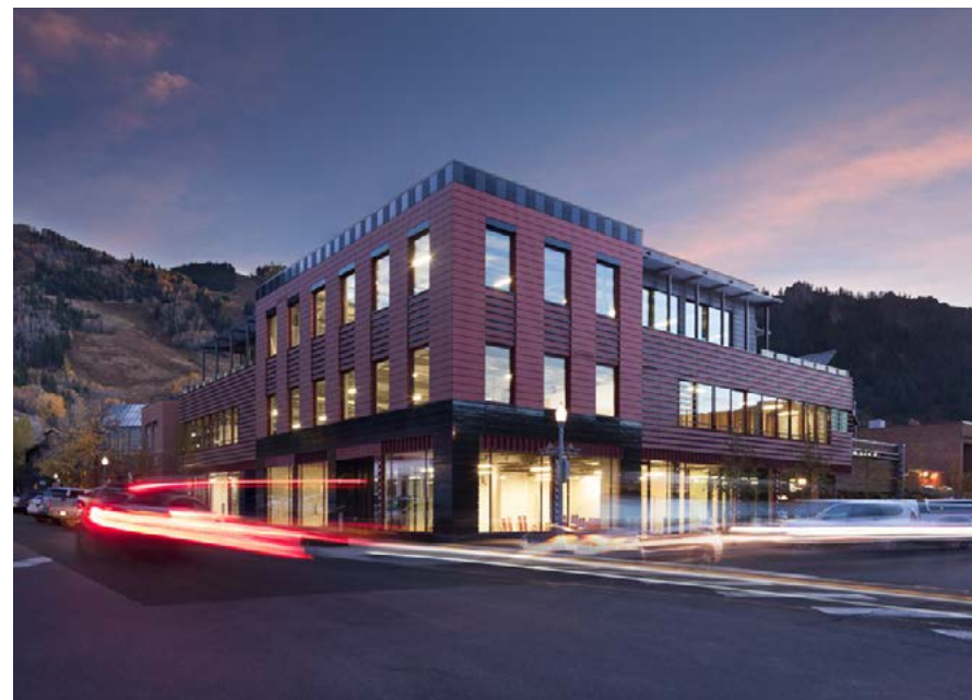
Aspen Snowmass Sotheby's International Realty | Colorado, USA | $25,000,000 USD

Last month United Kingdom Sotheby's International Realty closed on what is undoubtedly one of the most famous residential addresses in the world; Eaton Square is centrally located moments from the King's Road, Sloane Square and Knightsbridge. An impressive first and second floor duplex apartment situated on the southern terrace of a prestigious London Square, this residence was refurbished to the highest of standards complete with modern bathrooms and kitchens. The apartment maintains many of its impressive period features such as the high ceilings in the reception rooms.