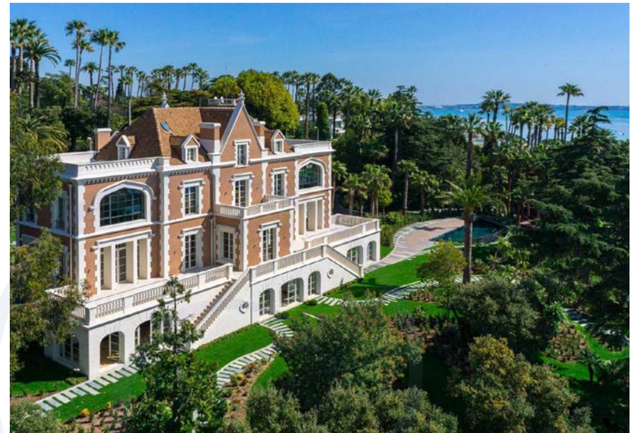
Côte d'Azur Sotheby's International Realty | Price Upon Request | Cannes, France | PropID: 3JSLGB

A beachfront estate located in the exclusive gated community of Old Fort Bay, this home features ocean views from nearly every room. The architectural details include a dramatic double staircase in the entrance foyer, pocket glass sliding doors, coffered ceilings and stone columns. The bespoke Downsview kitchen has top-of-the-line appliances, marble counter tops and opens to a family room with terrace access and ocean views. Wake up to the sounds and colors of the ocean in the spacious master bedroom; the master bath has marble counter tops, soaking tub and spacious walk-in shower.