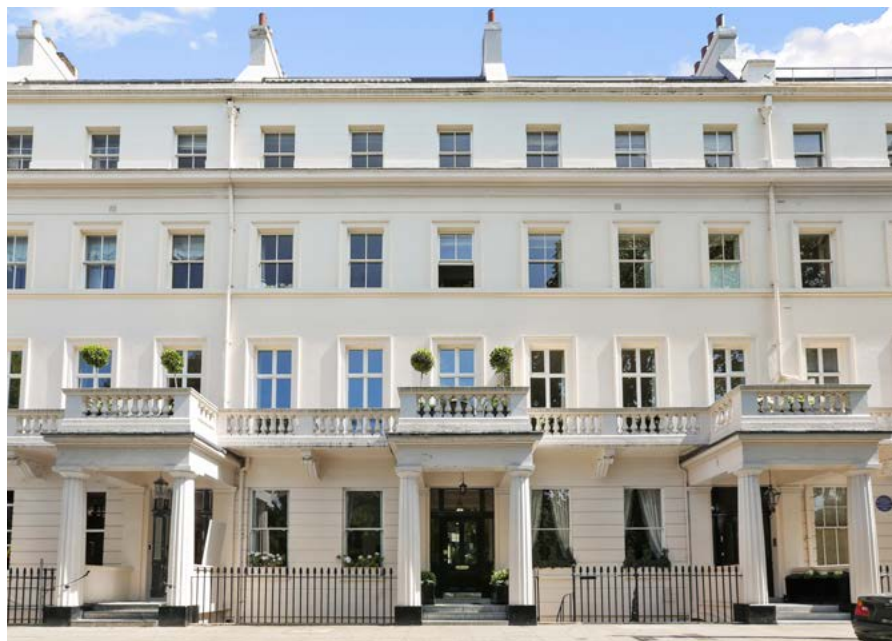
United Kingdom Sotheby's International Realty | United Kingdom | £ 9,875,000 GBP

Last month United Kingdom Sotheby's International Realty closed on what is undoubtedly one of the most famous residential addresses in the world; Eaton Square is centrally located moments from the King's Road, Sloane Square and Knightsbridge. An impressive first and second floor duplex apartment situated on the southern terrace of a prestigious London Square, this residence was refurbished to the highest of standards complete with modern bathrooms and kitchens. The apartment maintains many of its impressive period features such as the high ceilings in the reception rooms.