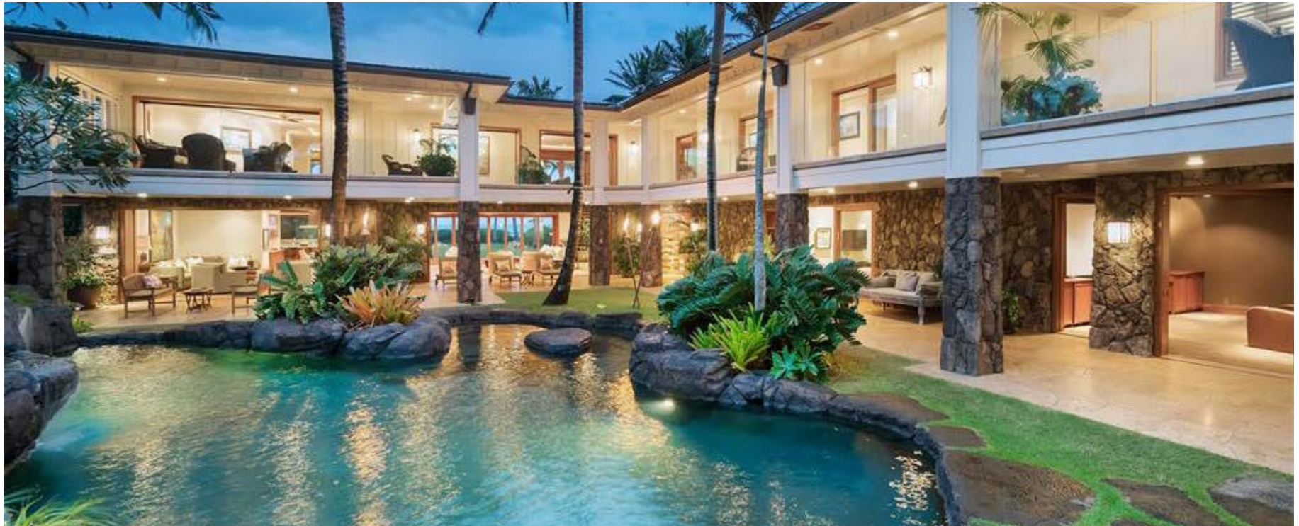
Carvill Sotheby's International Realty | Kailua, Hawaii | $24,980,000 USD | PropID: PKFE8F

210 Kalaheo is one of Oahu's most significant beachfront estates and is unrivaled in size and quality of workmanship. Astonishing luxury and resort-like amenities highlight the 17,333 square -feet of covered living on approximately 1.5 acres. Privately gated and set among tropical gardens, the three-bedroom guest house leads to the grand entrance of the five-bedroom main residence. The Hawaiian lifestyle is accentuated by the indoor and outdoor spaces, masterfully blending the lanais and interior living areas.