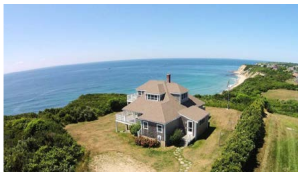
Sullivan Sotheby's International Realty | Block Island, Rhode Island $2,800,000 USD | PropID: XVG2TJ