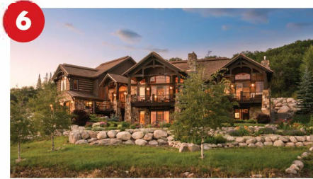
6 622 FOREST VIEW DRIVE $3,275,000 5bd/5+ba/6,822sf Fish Creek Falls Road, R on Steamboat Blvd, L on Forest View Drive, on the R THE ZOPF TEAM 970.846.5310