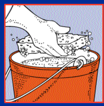
U.S. EPA Washington DC 20460 U.S. CPSC Washington DC 20207 U.S. HUD Washington DC 20410