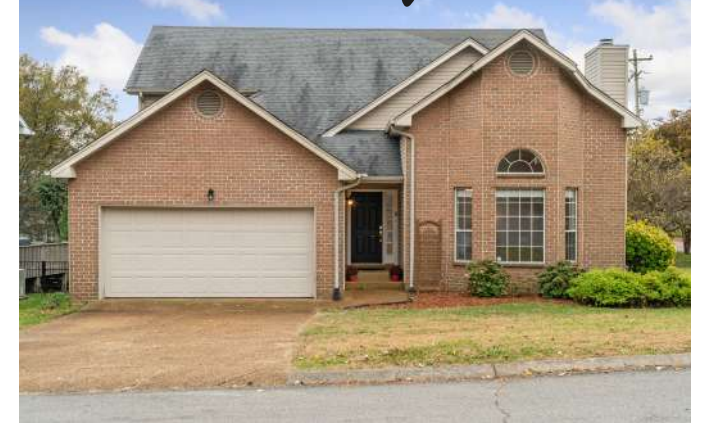
Woodfield Cove | $433K