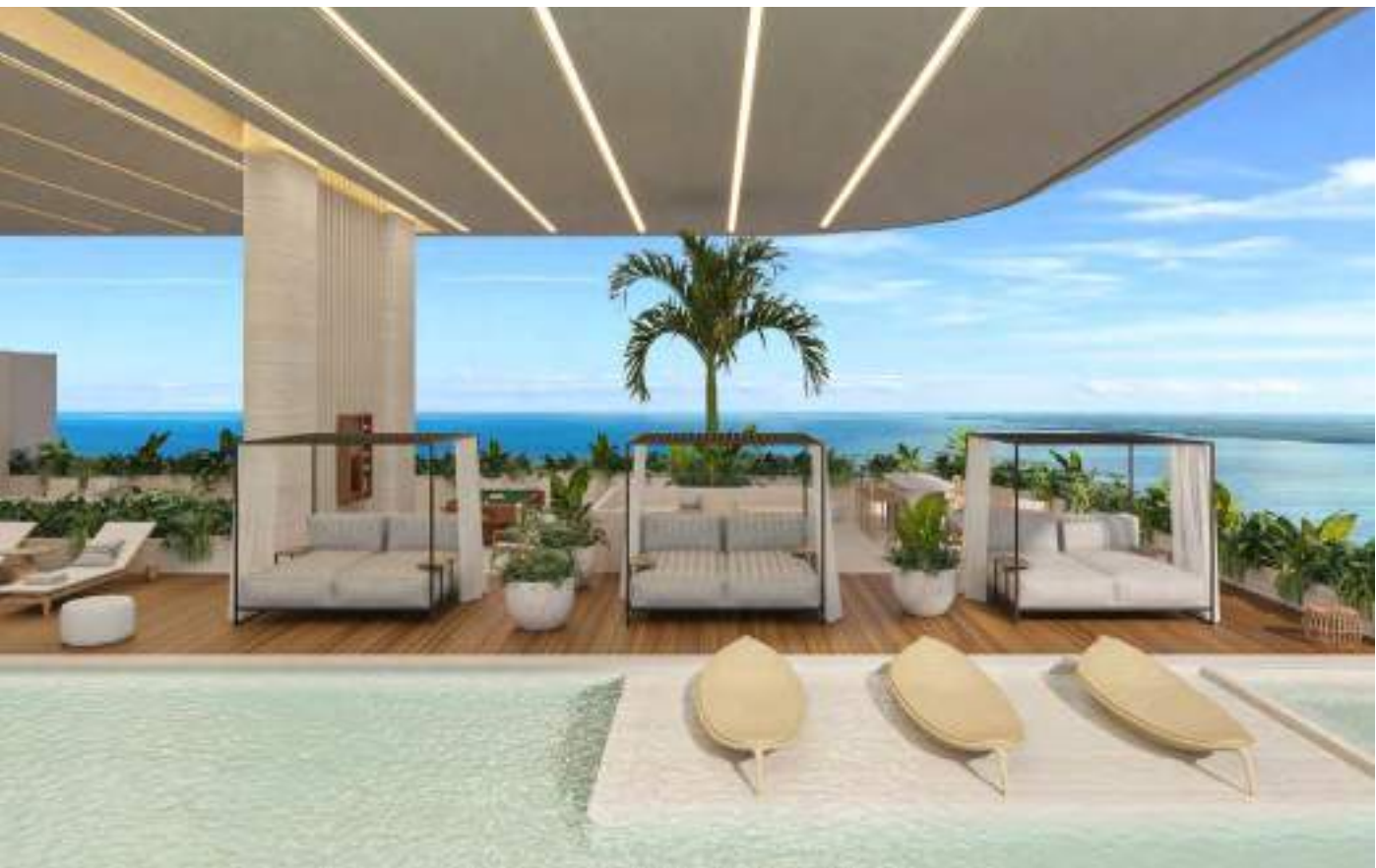
OCEANFRONT INFINITY POOL & TERRACE - THE CLUB AT 5TH FLOOR