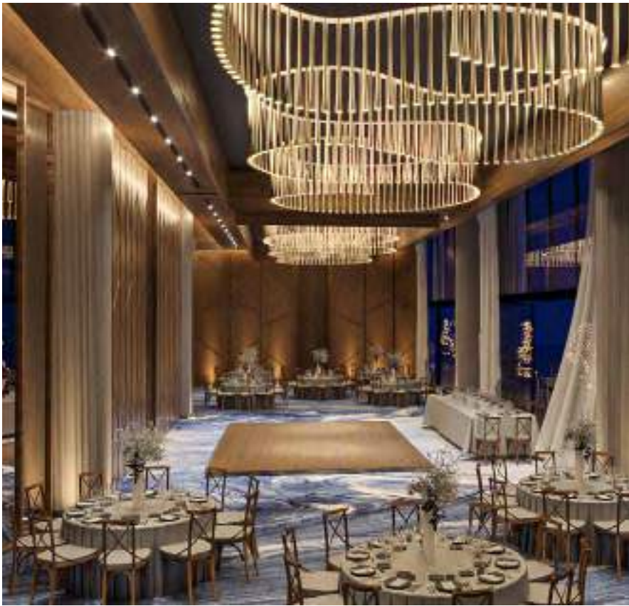
THE ASTOR BALLROOM