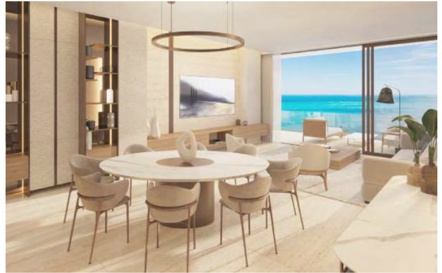
RESIDENCE 1 - DINING &amp; LIVING ROOM