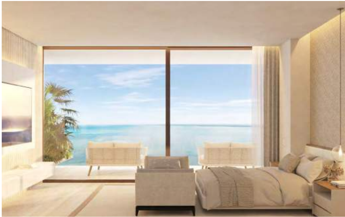
RESIDENCE 7 - MASTER BEDROOM