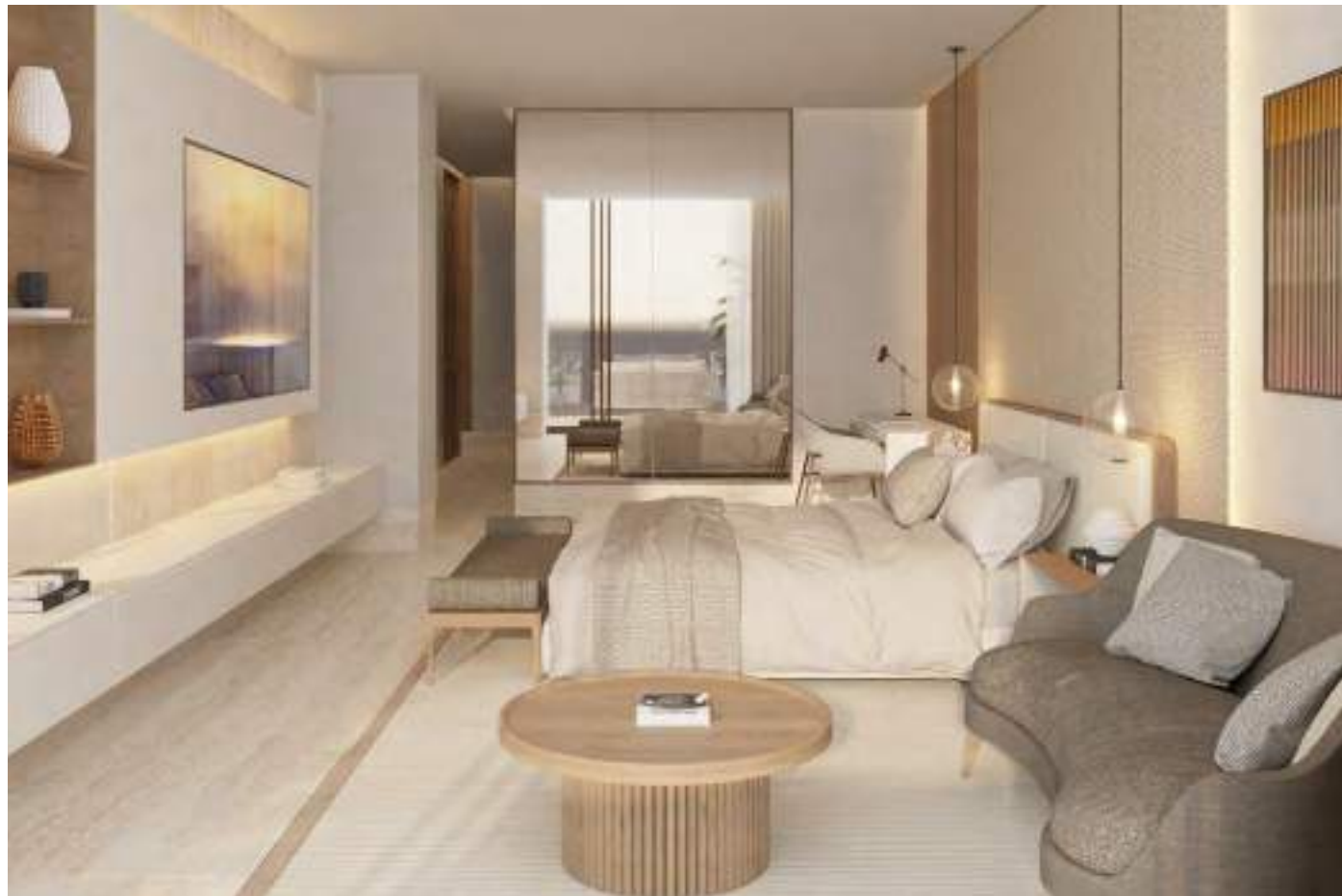
RESIDENCE 1 - MASTER BEDROOM