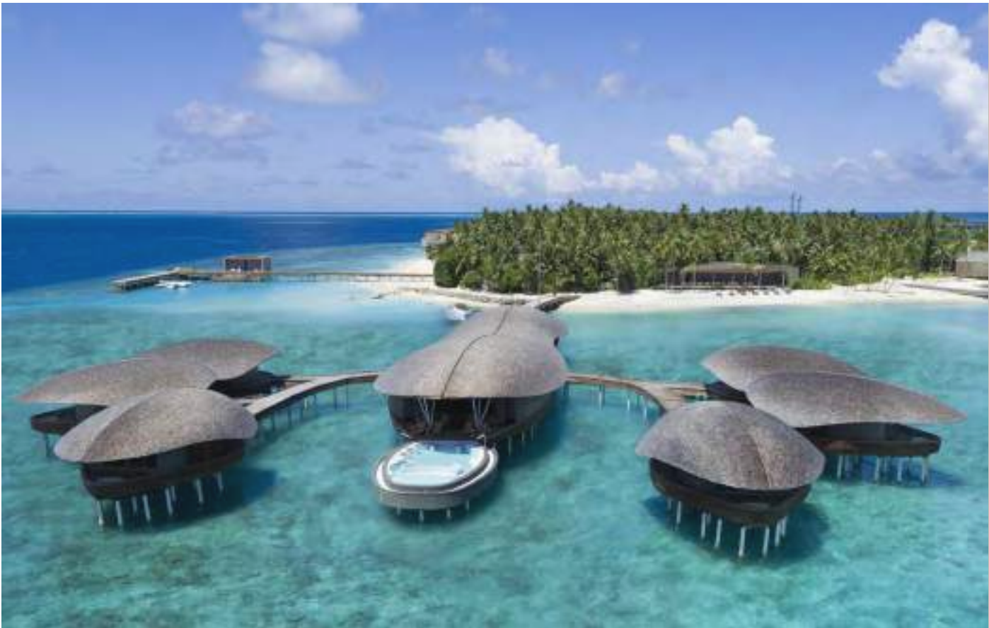
THE ST. REGIS MALDIVES VOMMULI RESORT