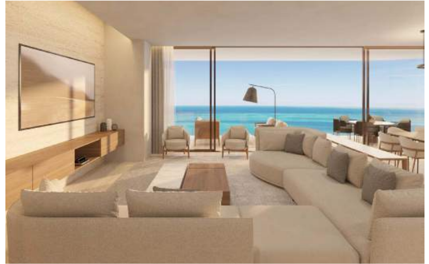
RESIDENCE 7- LIVING ROOM