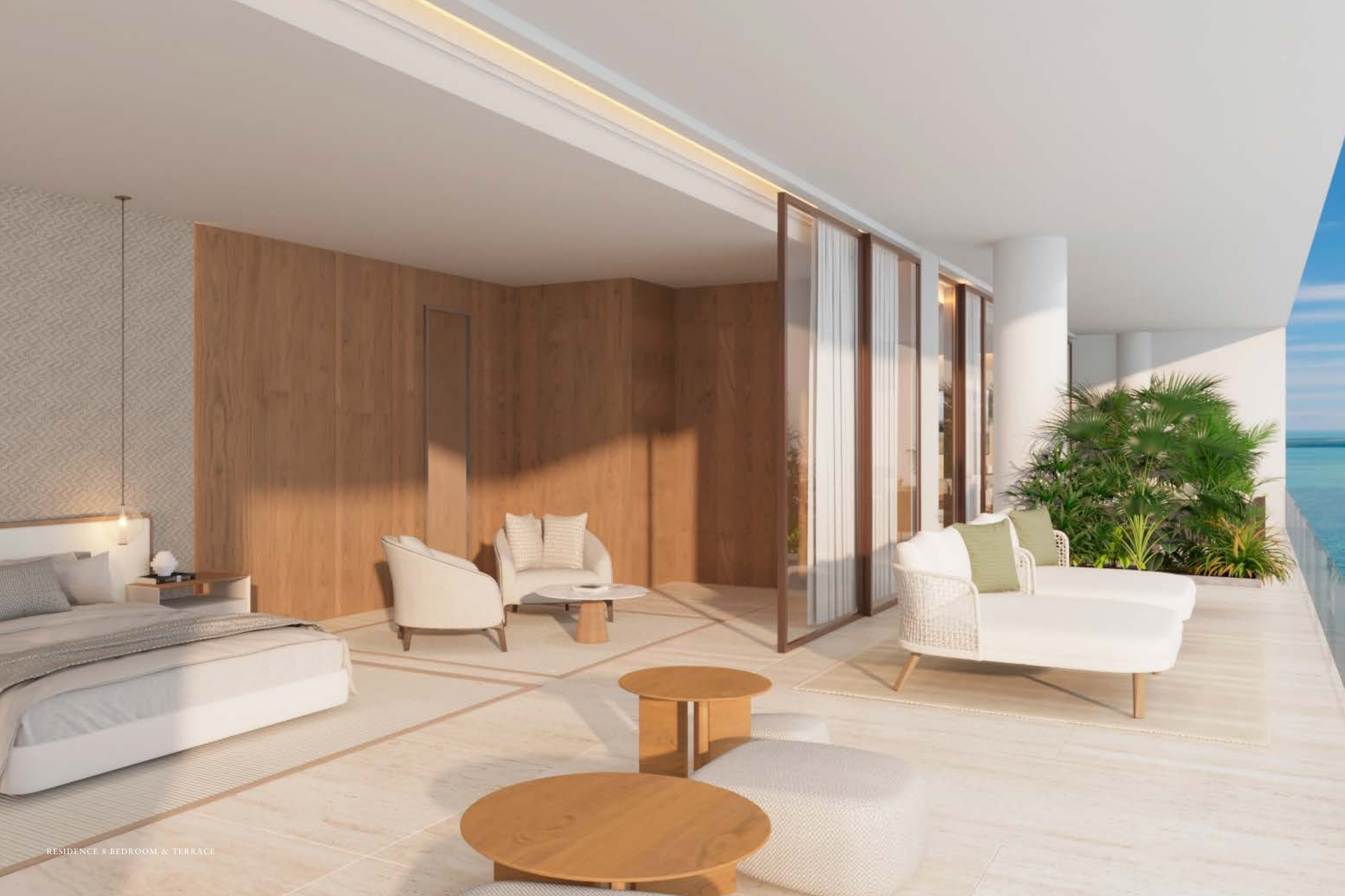
RESIDENCE 8 BEDROOM & TERRACE