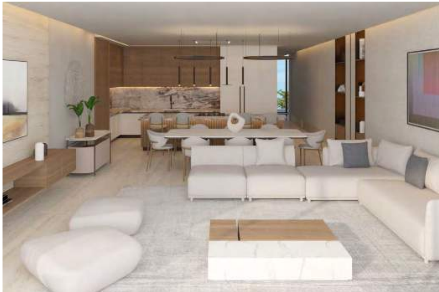
RESIDENCE 5 - GREAT ROOM