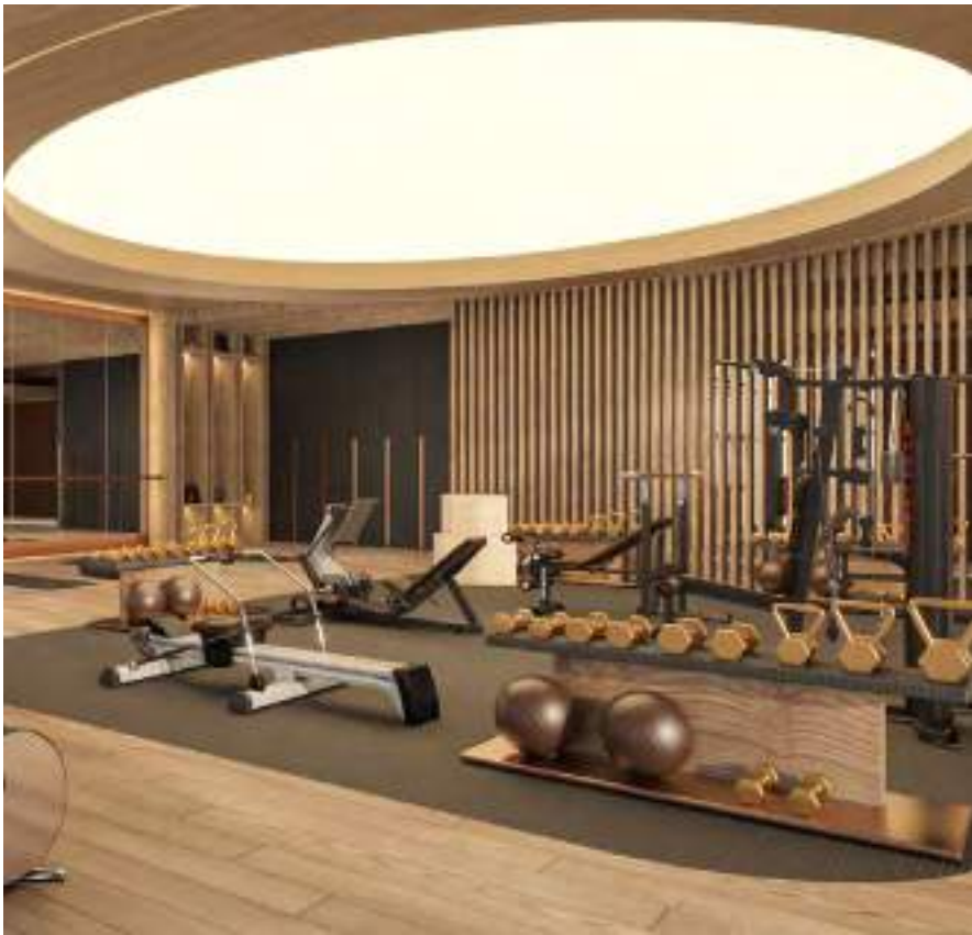
PRIVATE FITNESS ROOM