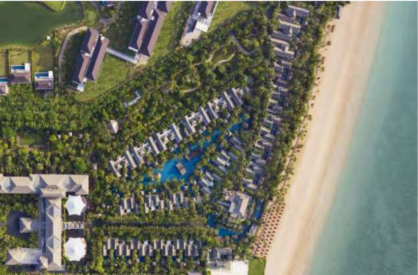
THE ST. REGIS BALI RESORT