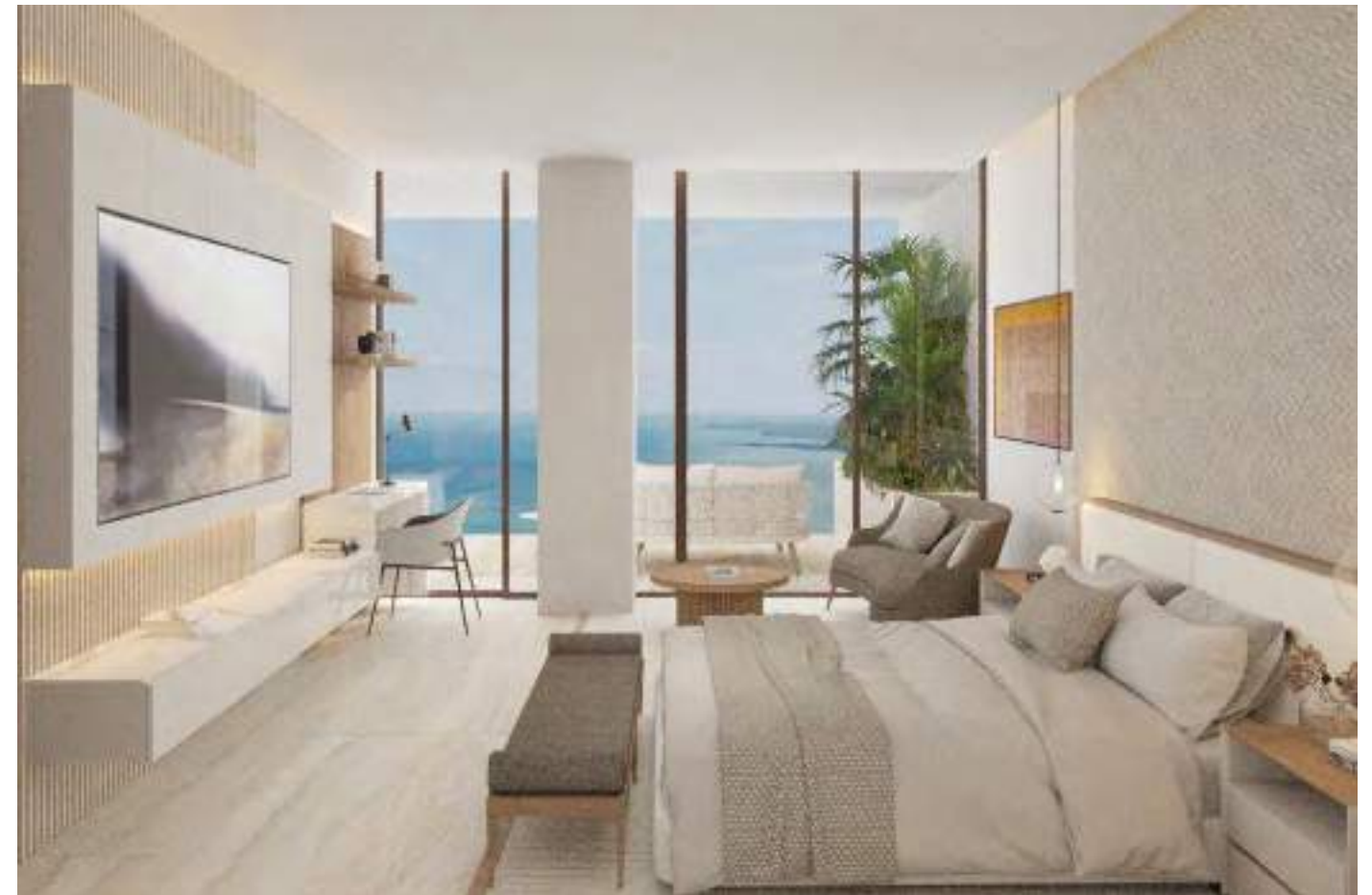
RESIDENCE 5 - MASTER BEDROOM