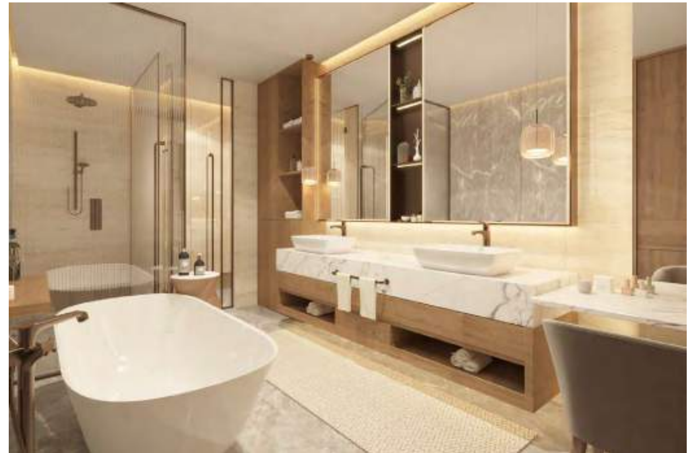
RESIDENCE 1 - MASTER BATHROOM