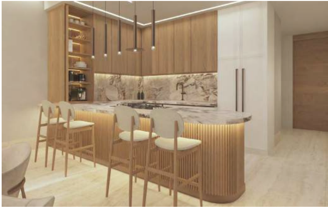
RESIDENCE 1 - KITCHEN