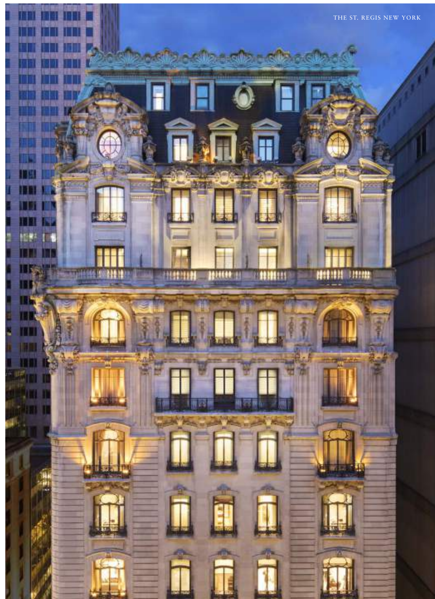
THE ST. REGIS NEW YORK