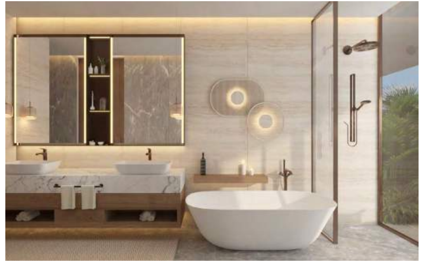
RESIDENCE 5 - MASTER BATHROOM