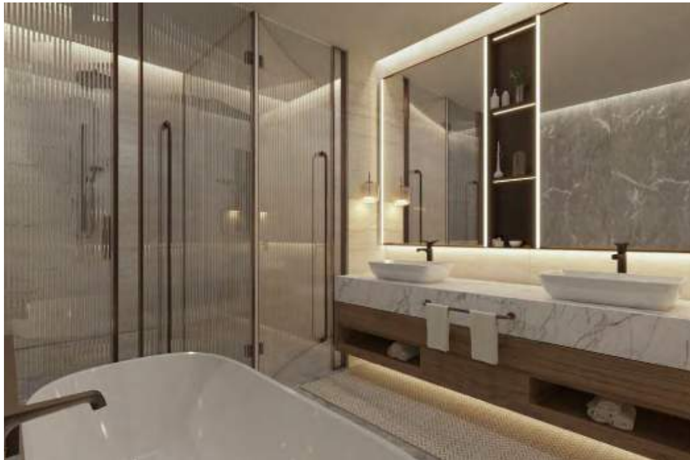
RESIDENCE 7 - MASTER BATHROOM