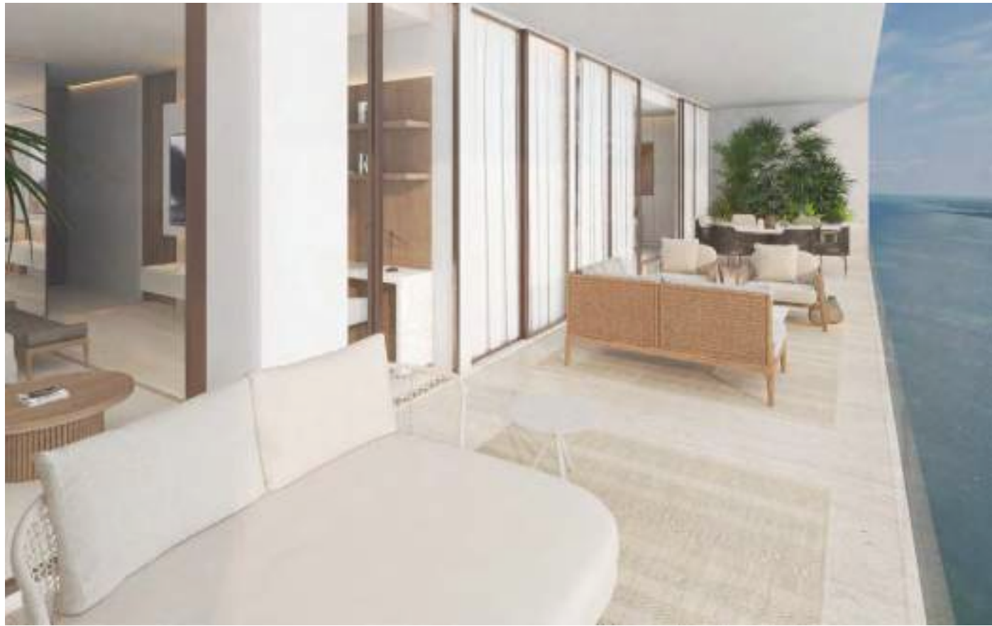
RESIDENCE 5 - TERRACE