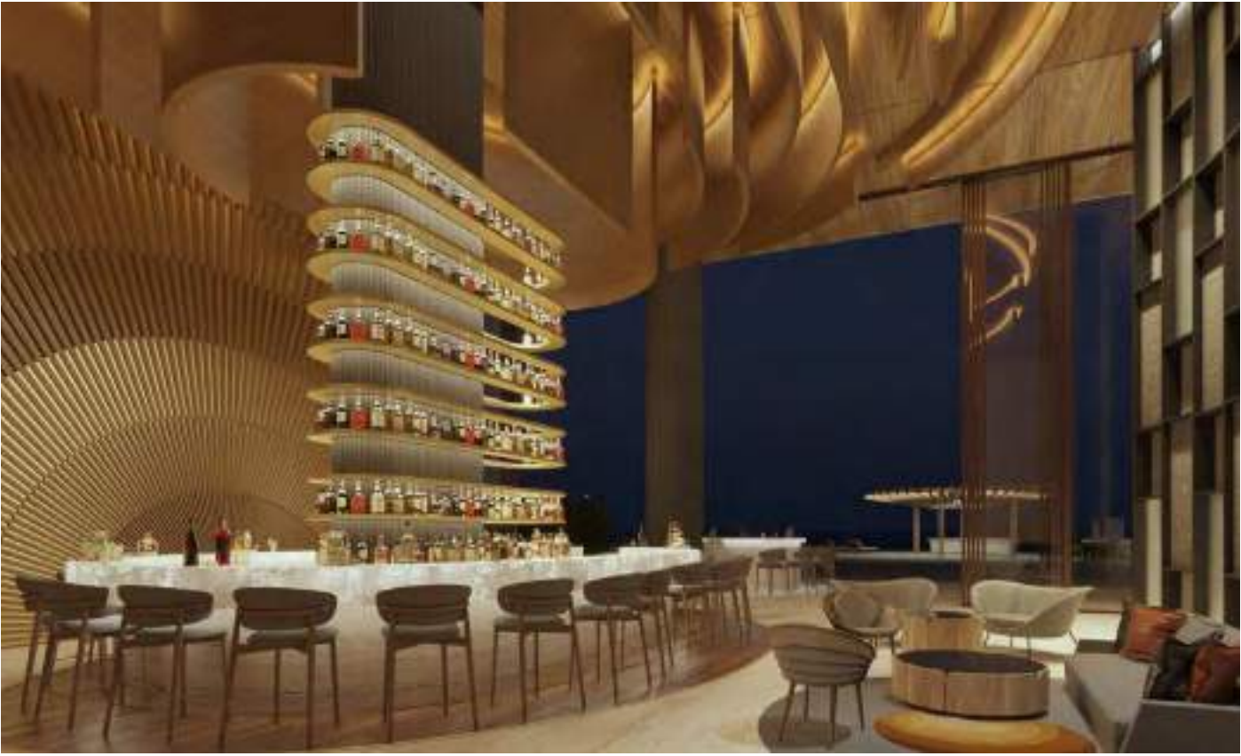
THE ST. REGIS KING COLE BAR