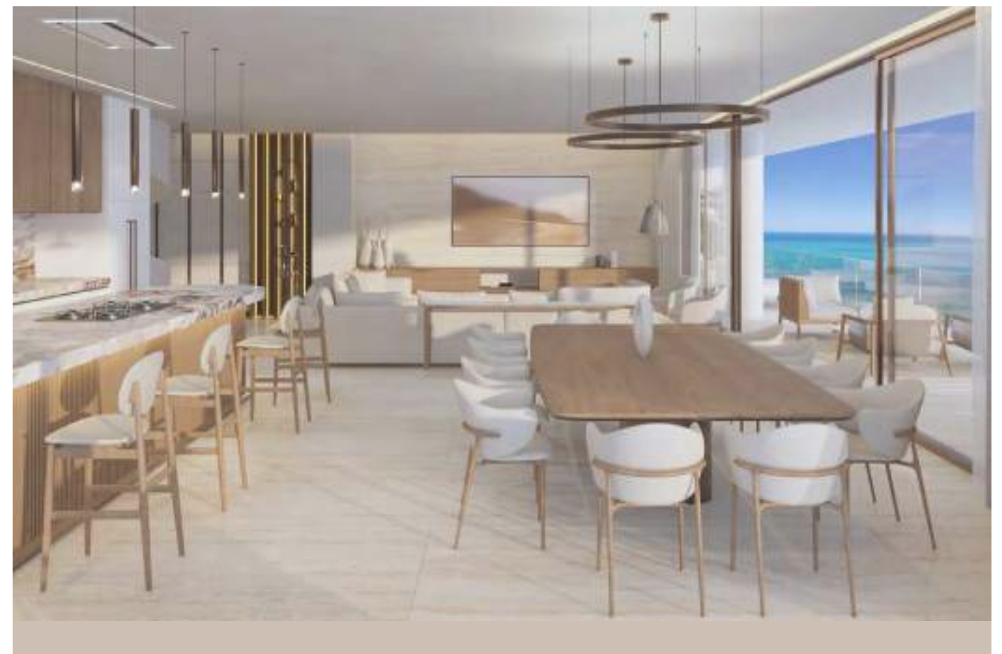
RESIDENCE 7 - DINING ROOM &amp; OPEN KITCHEN