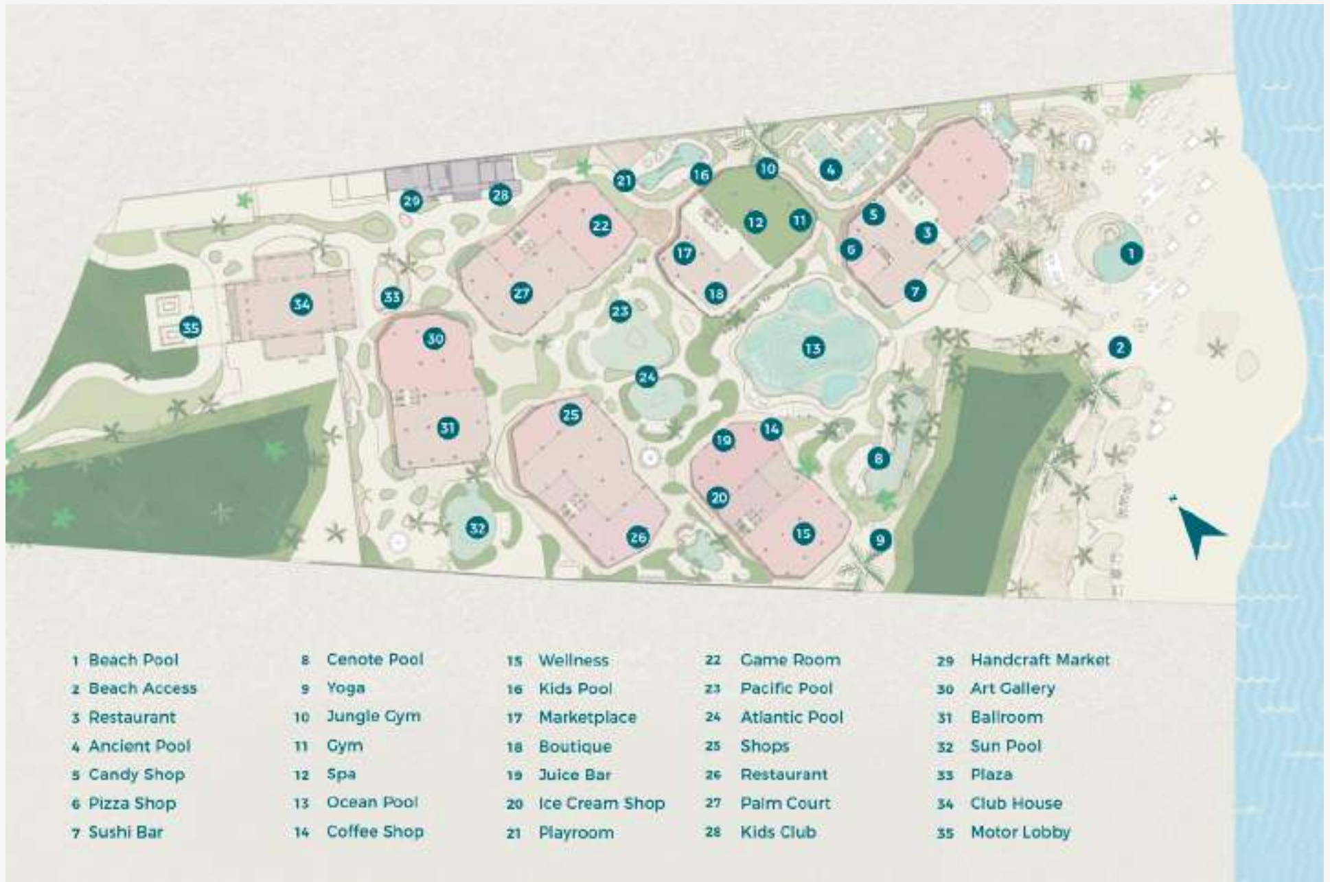
COSTA RESIDENCES & BEACH CLUB MASTER PLAN