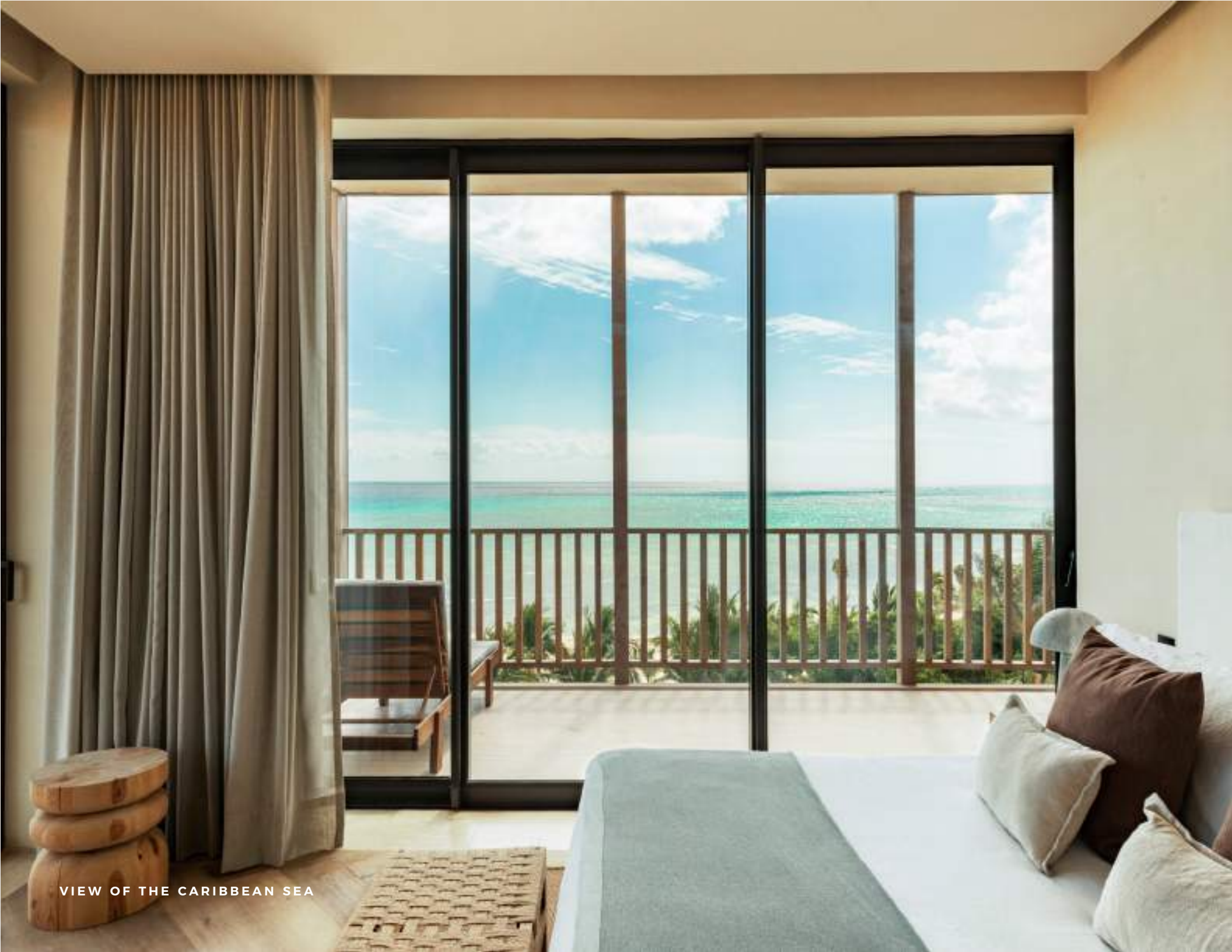
VIEW OF THE CARIBBEAN SEA