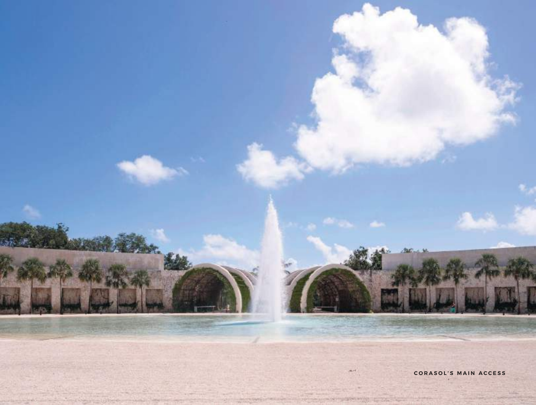
CORASOL'S MAIN ACCESS