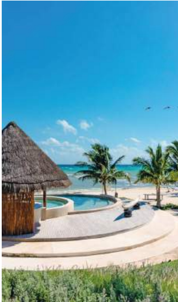
Costa Beach Club