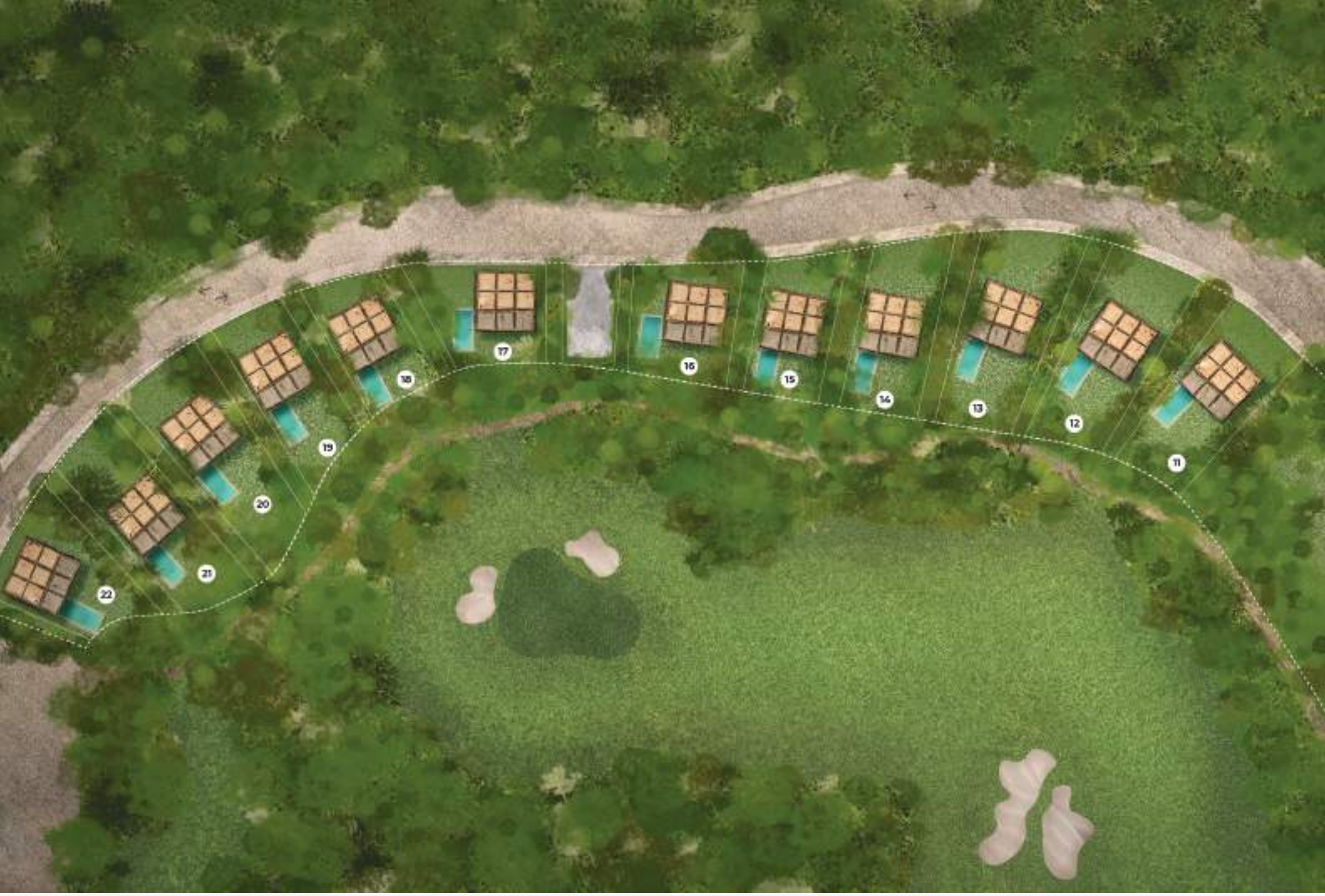
PALM VILLAS ESTATE HOMES PHASE 2