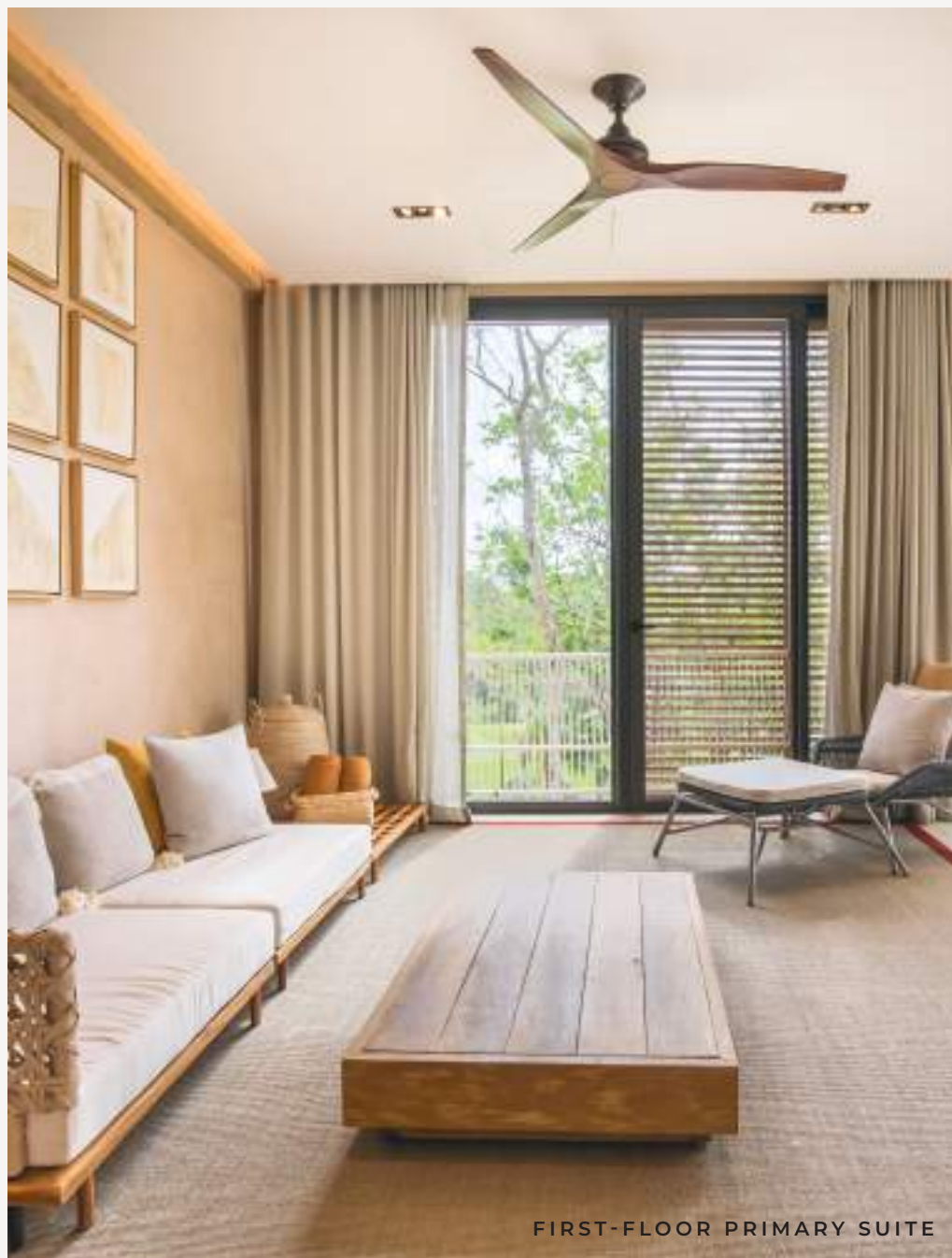
FIRST-FLOOR PRIMARY SUITE