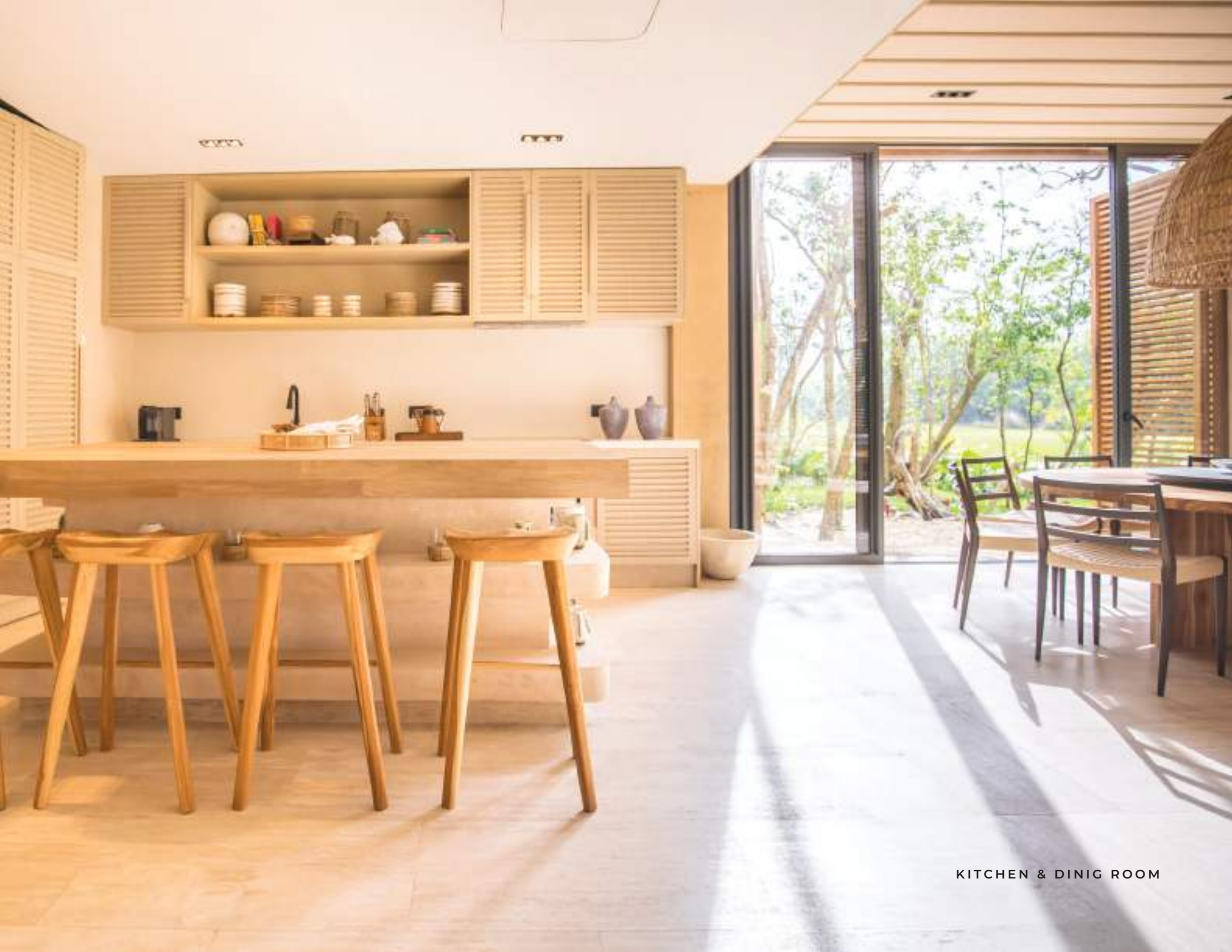
KITCHEN & DINIG ROOM