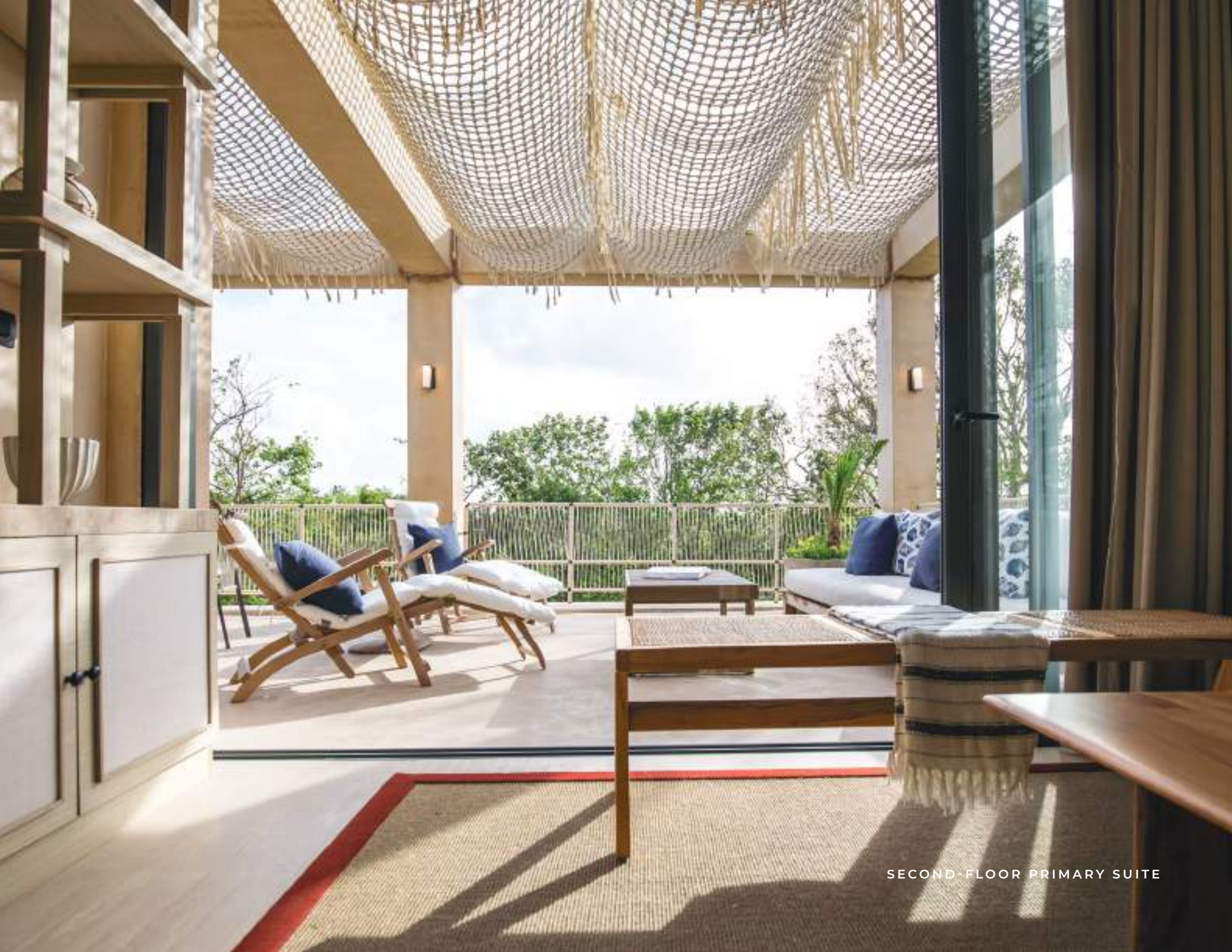
SECOND-FLOOR PRIMARY SUITE