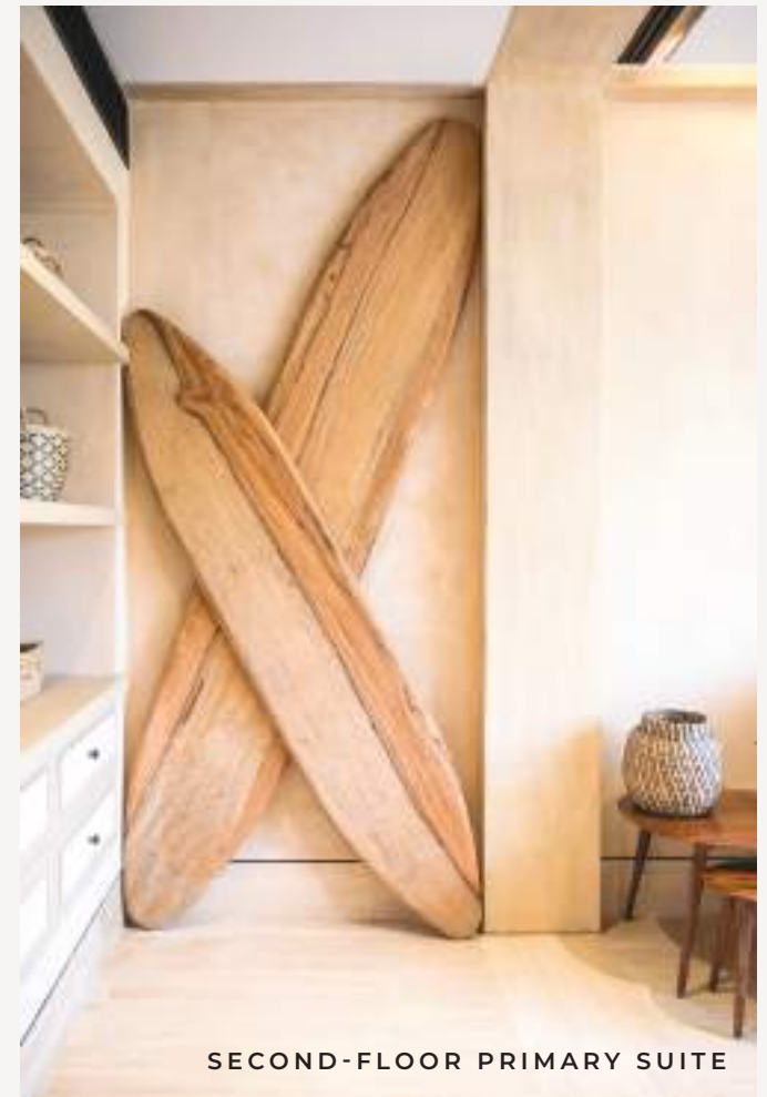
SECOND-FLOOR PRIMARY SUITE

Each estate also enjoys professional, year-round property management as well as coveted proximity to Corasol's range of activities, amenities and services.