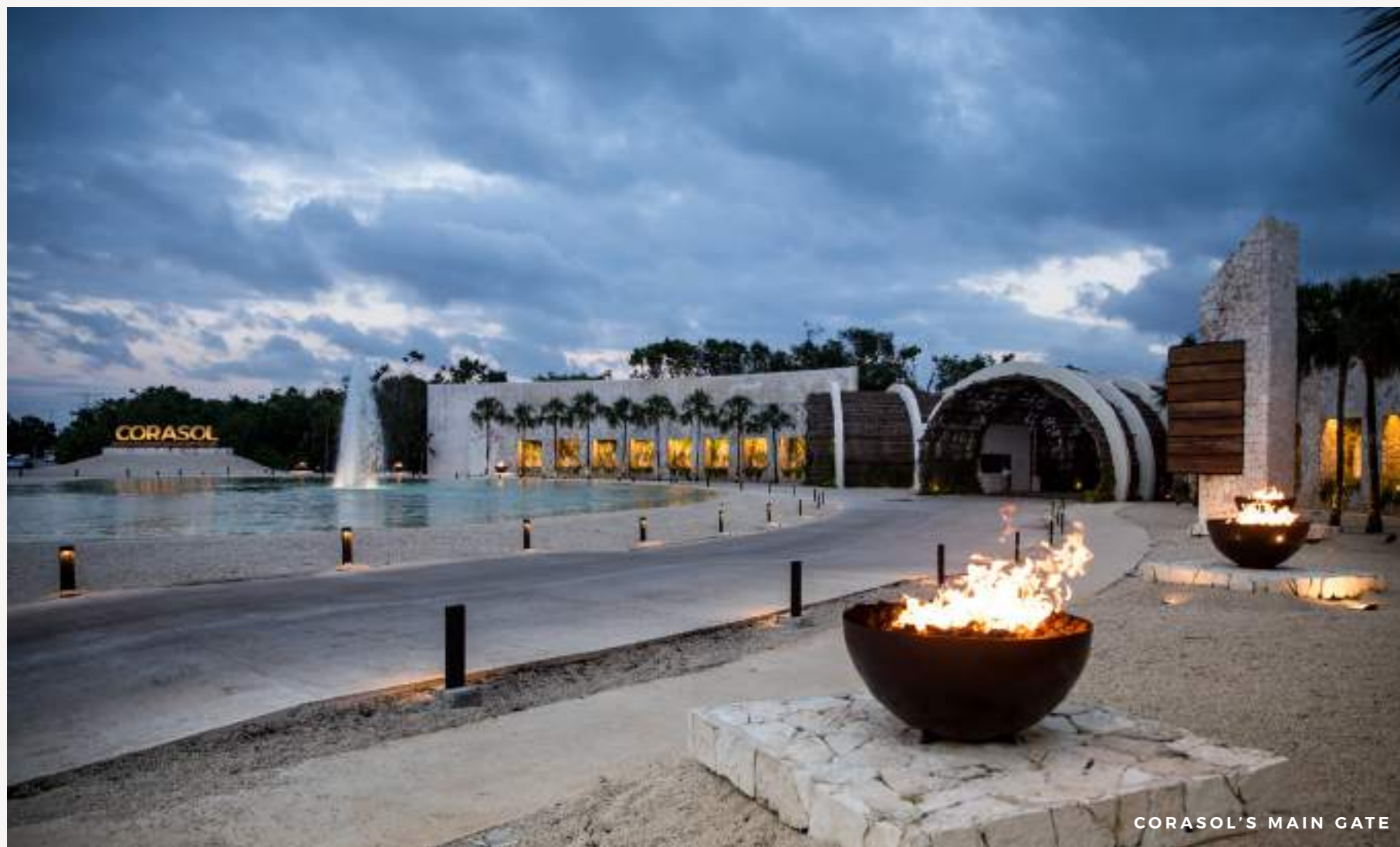
CORASOL'S MAIN GATE