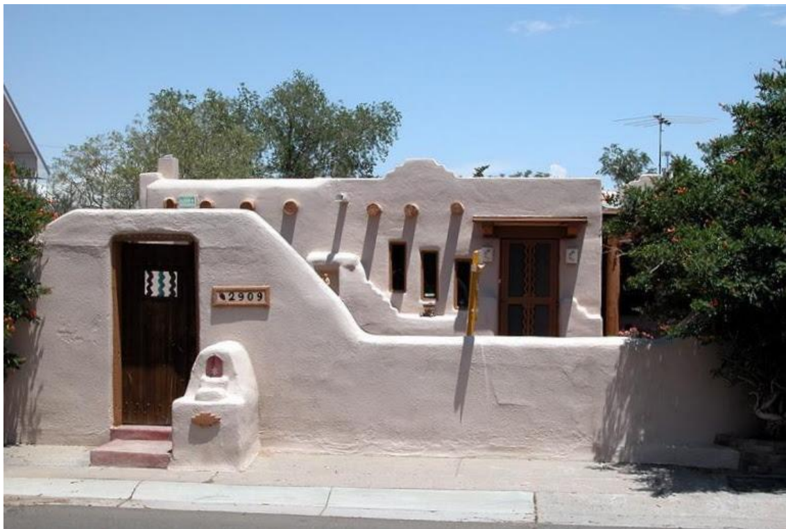
Leon Watson's Los Altos neighborhood has all the unique features the prolific