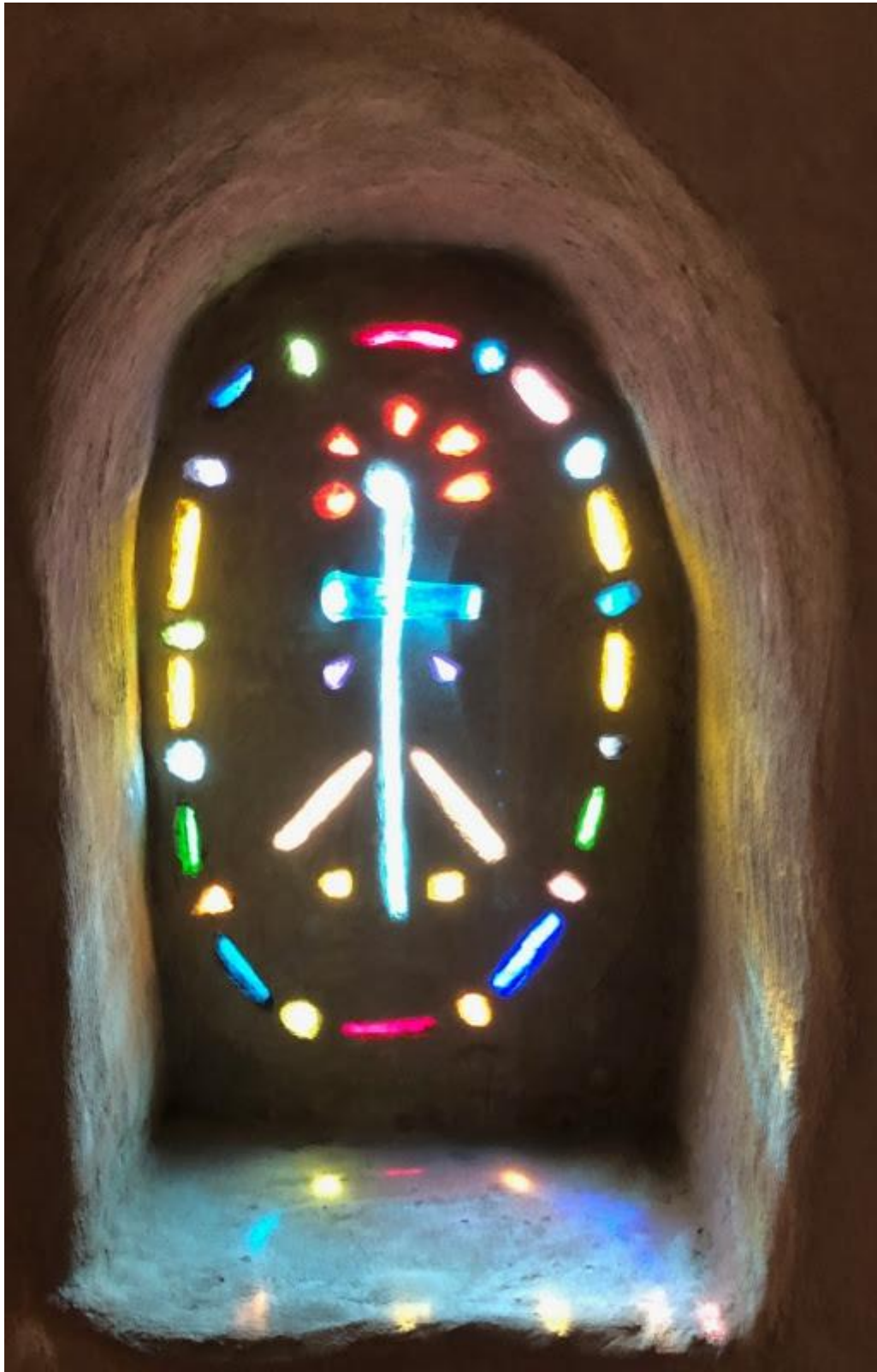
Above & below are two stained glass window features seen in Watson's adobes, each found miles apart. The colorful nicho above is from the 711 16th St property & sits in a bedroom there. The vivid window/wall scene below, adjacent to the (typical) living room Kiva, is from a Watson home in the community of Los Altos, a discreet pocket neighborhood in the South Valley near Bridge & Old Coors Blvds.