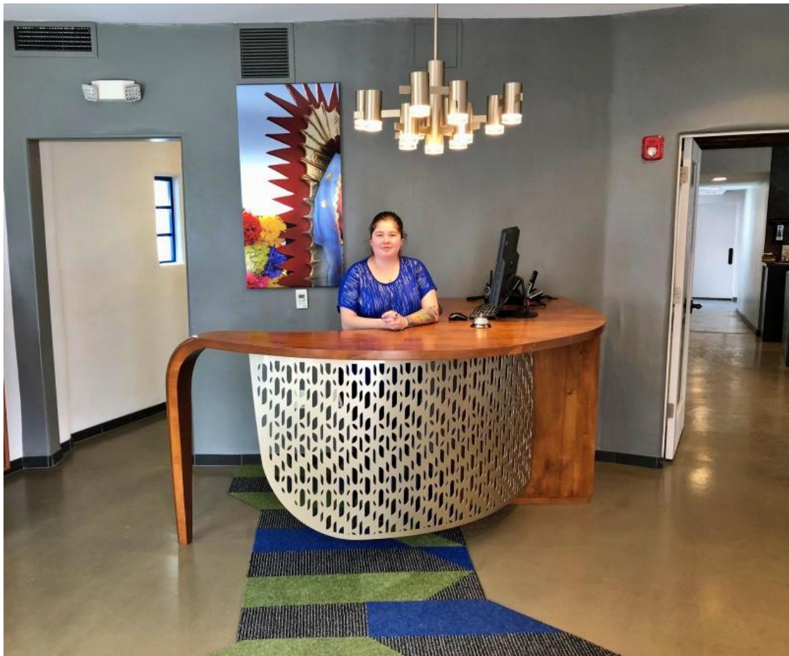
By 2018, the motel had undergone an $18 million upgrade drawing from private &