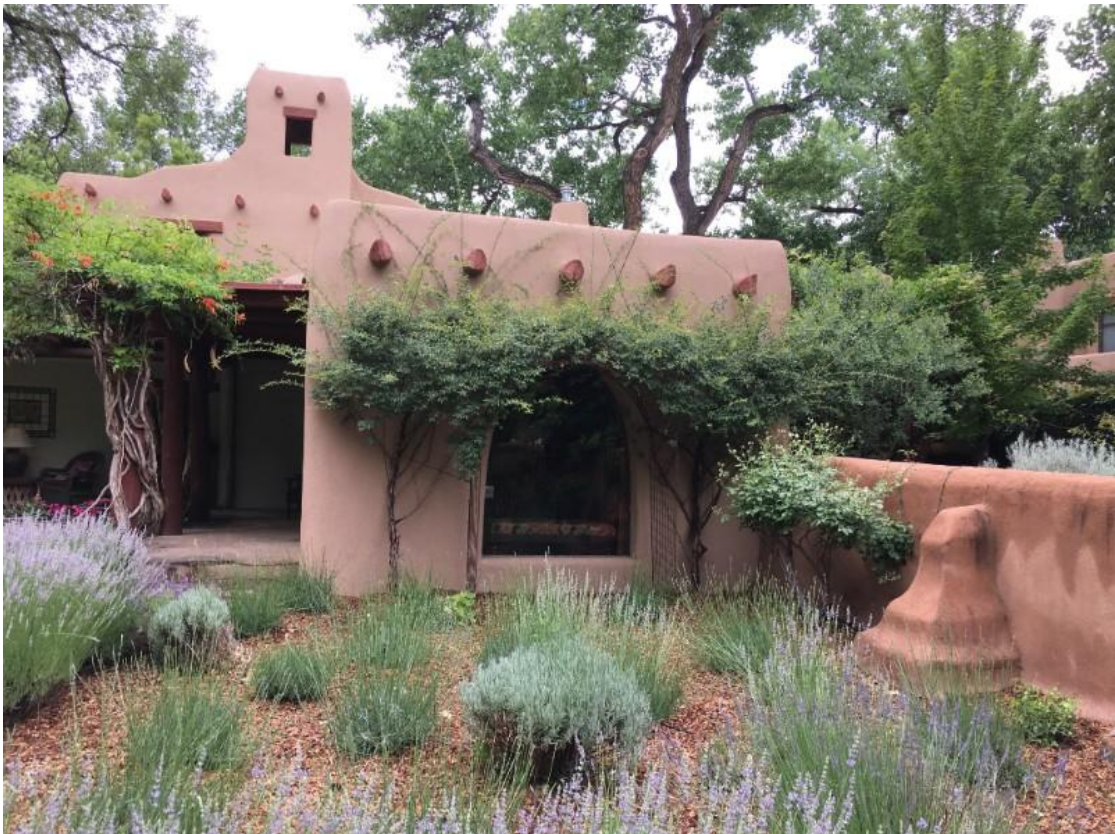
Directly above, & the trumpet vine garden below, surround a remarkable Spanish