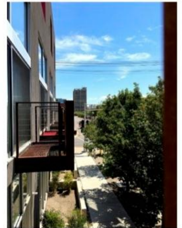
Downtown -- Loft