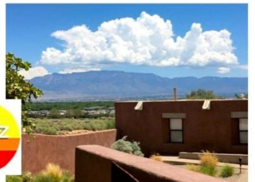
West Side -- Townhome