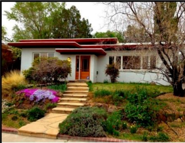
Spruce Park, east of Downtown near the UNM Campus, has some wonderful Mid-Century Modern homes, seen above.