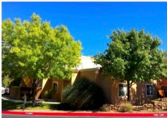
NE Heights -- Condo

Current Listings: Click on any image to view the Visual Tour.