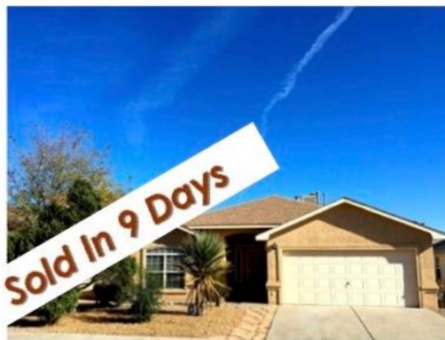
Ventana Ranch -- Ranch