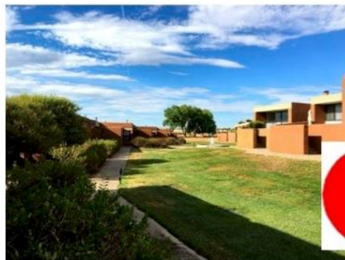
La Luz -- Townhome