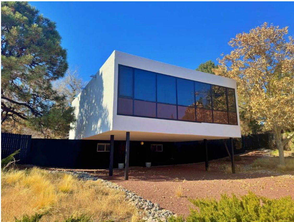
The Netherwood Park home, above, is the younger-nibling of one of the most iconic Mid-Century Modern structures, le Corbusier's French Villa Savoye .