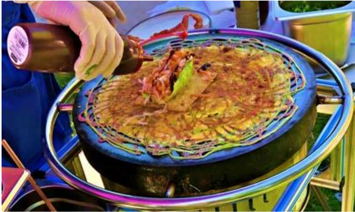
Final touches on the work of culinary art--then it's time for breakfast...