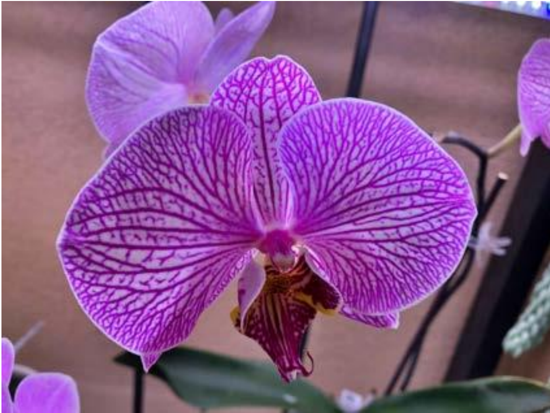
One final orchid image, from the shoebox Orchid Garden...wow.