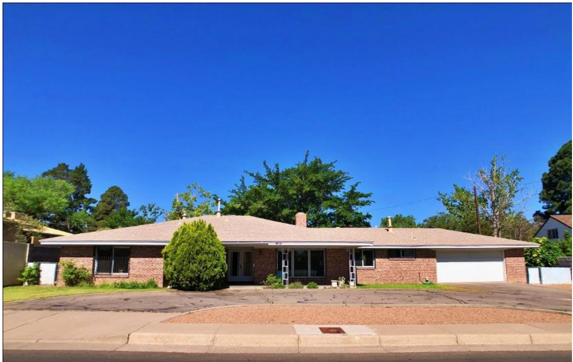
Fifty+ Years At Home